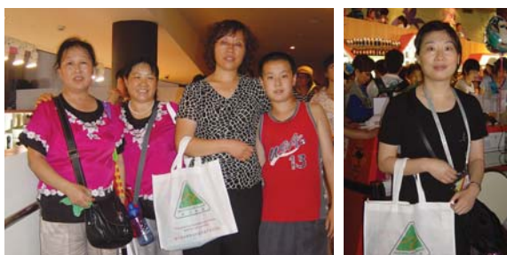
Visitors to the Australian Pavilion with their AMAG logo bags